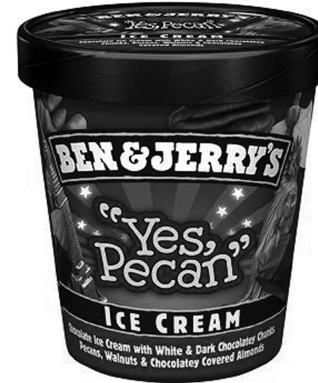
Figure 1 Ben & Jerry’s speaking its mind.

There are two main routes for Ueber-Brands to get to this ‘Mission Incomparable’. The first route is the one we think of as ‘the holy grail of missions’ and is often called ‘Purpose’: a socio-eco-political goal at the heart of the brand’s existence. A good example of this is Ben & Jerry’s, the ice cream brand whose originating reason