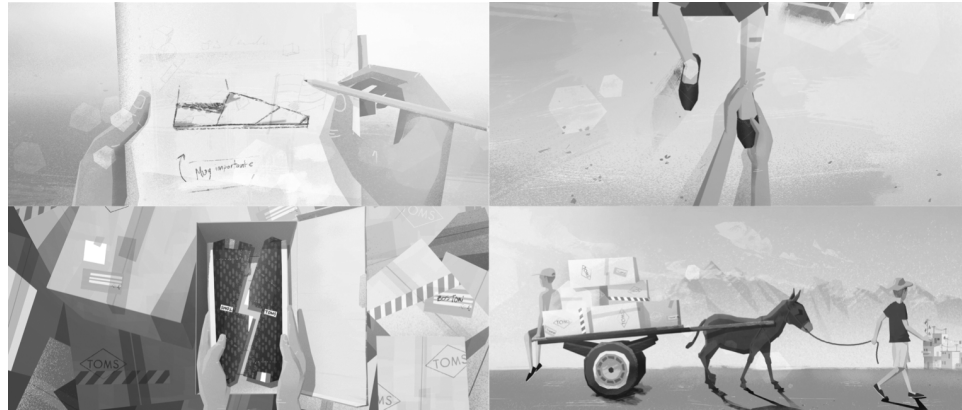
Figure 3 Ueber-Brands are less about what you buy than about what you buy into. TOMS' 'One for One giving model' is a prime example.

his venture has grown to a US$600m business covering many countries, supporting students in Africa with school uniform shoes as much as Syrian refugees with winter boots. He has perfected the model, working with select 'giving partners', providing 'last mile expenses' to ensure local organisations have the capital to get the shoes where they are needed and encouraging employees to go on 'giving trips' to experience giving first hand. Speaking of people: they are the best 'advertising' for TOMS, as Tsavdarides says. TOMS only hires believers in their mission, and their passion works like a word-of-mouth wonder machine. They create a community with a shared sense of purpose, which is exactly the point. And the product has become much better and more varied over time, because at the end of the day in modern prestige even if the Why is important, you cannot win in the long run if you neglect the What. Doing good can never be an excuse for not making something well — in that even modern prestige is still as traditional as it always was.