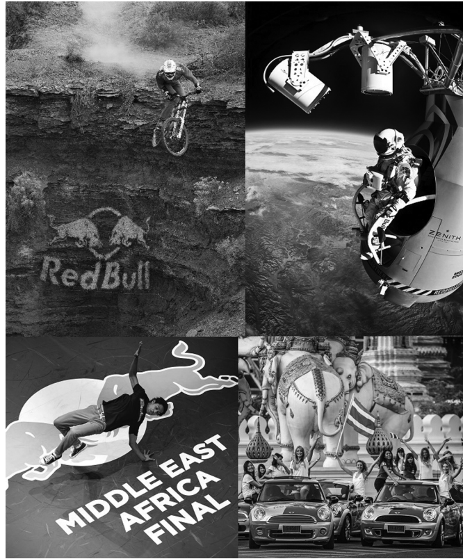
Figure 4 The adrenaline-infused world of Red Bull: From break-dance to jumping off a cliff or into the stratosphere.

wants to hear about her product. Yet it is exactly this polarising taste that is one of the important enablers of Red Bull's success. It puts the brand outside of anything that had ever been seen or tasted in soda — creating intrigue and exclusivity. It is an acquired taste and very effectively separates those who are 'in' from those who are — sometimes vocally — not, like parents of school children worrying about drug-like effects. This separation of 'insiders' and 'the others' is one of the essential markers of exclusivity, esteem and related pricing power we examine in detail in our book.